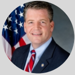
NEW YORK STATE SENATOR Terrence Murphy