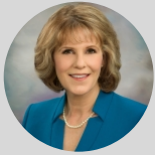
NEW YORK STATE SENATOR Catharine Young