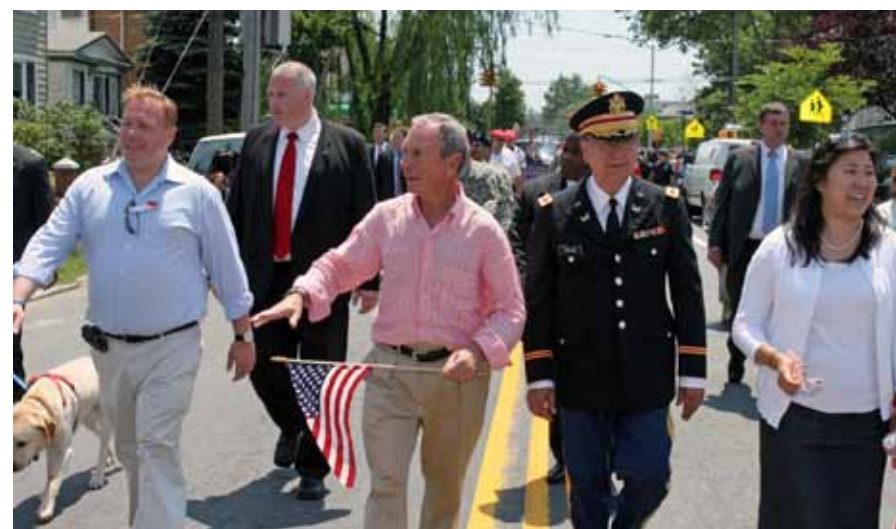
Councilman Dan Halloran, Mayor Bloomberg, Senator Padavan and Assemblywoman Grace Meng at the Whitestone Memorial Day Parade on Monday May 31, 2010.