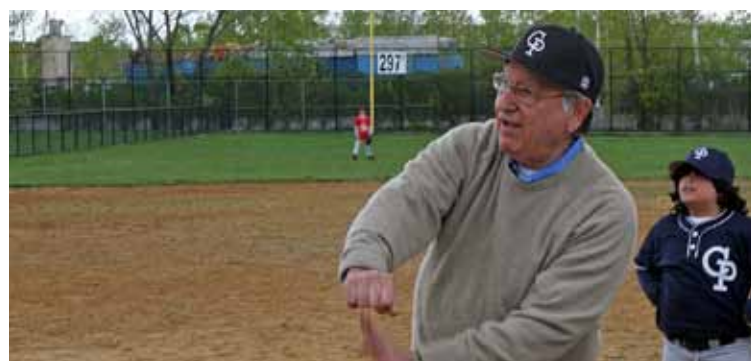
Senator Padavan throws out the ceremonial first pitch to mark start of the College Point Little League season