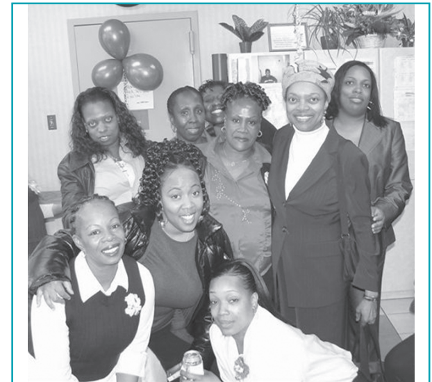
Senator Montgomery celebrates the 5th Anniversary of Serendipity, a residential substance abuse treatment program for adults in Brooklyn's Bedford Stuyvesant community. The Senator is pictured here with Serendipity residents. The program is operated by New York Therapeutic Communities, Inc.

Advocates for the rights of city and state prisoners, parolees, ex-offenders, and their families. Responds to a wide range of medical complaints due to AIDS-related discrimination within the criminal justice system. Offers AIDS discrimination brochures in English and Spanish, free of charge.