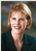
Senator Catharine M. Young, Chair

The NYS Legislative Commission on Rural Resources is a joint bi-partisan office of the State Legislature.