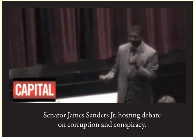
Senator James Sanders Jr. hosting debate on corruption and conspiracy.

In light of the accusations of corruption being predominantly pointed at minority officials, I hosted a debate at the Black Spectrum Theater , on Friday, May 10, examining whether these accusations were grounded in corruption of the individuals in office or a conspiracy by higher powers targeting minority officials. Three participants debated on the side of corruption, and three debated on the side of conspiracy. Through a final vote of a raise of hands by the audience, the verdict was corruption.