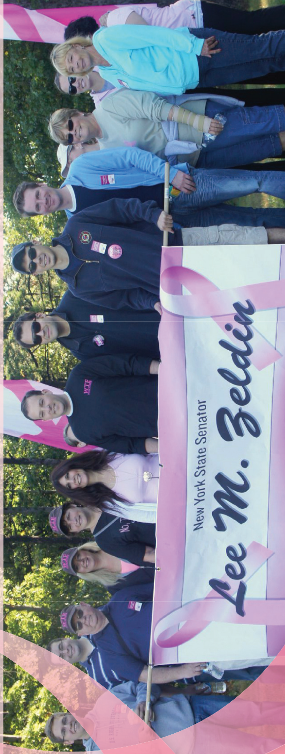
State Senator Lee M. Zeldin (R, C, I-Shirley) participated in the Making Strides Against Breast Cancer Walk at Dowling College's Brookhaven Campus in Shirley. Senator Zeldin (above center) is pictured here with his team of 25 walkers from the local community who were able to raise over $3,000 for this worthy cause.

SENATOR LEE ZELDIN WANTS YOU TO KNOW THAT BREAST CANCER AWARENESS IS THE FIRST STEP IN THE FIGHT.