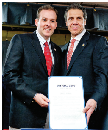
Senator Zeldin and Governor Cuomo at MTA Payroll Tax repeal bill signing

The elimination of this job-killing tax does just that.