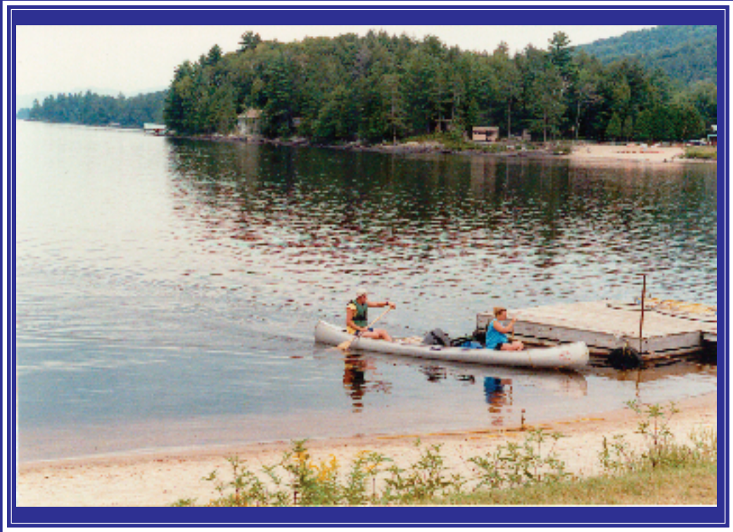
Long Lake in the Adirondacks

Published by the: NYS Legislative Commission on Rural Resources