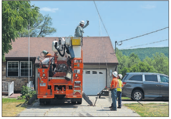
A NYSEG crew works to repair a power line on North Main Street Extension Monday afternoon.

The North Hornell Fire Department was called to the scene at 10:52 a.m. after Shawn Day, who lives near where the wires were knocked down, contacted 911 when wires nel. He went over and scene and provide mutual