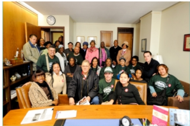
Representatives of PRATT, Neighbors Helping Neighbors and the Fifth Avenue Committee met with Senator Montgomery to thank her for her support of tenant protection laws and all of her work to preserve affordable rental housing.

New York State's rent regulation system enables more than 2.5 million people -- the vast majority of whom are moderate, or low-income -- to live in safe and affordable housing. Rent regulation helps counteract the destabilizing