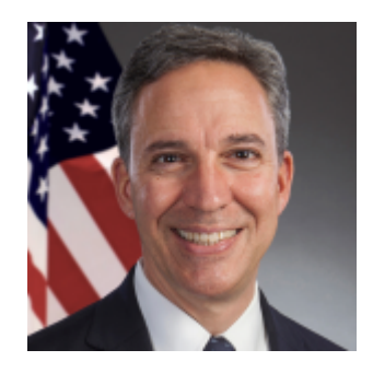
NEW YORK STATE SENATOR