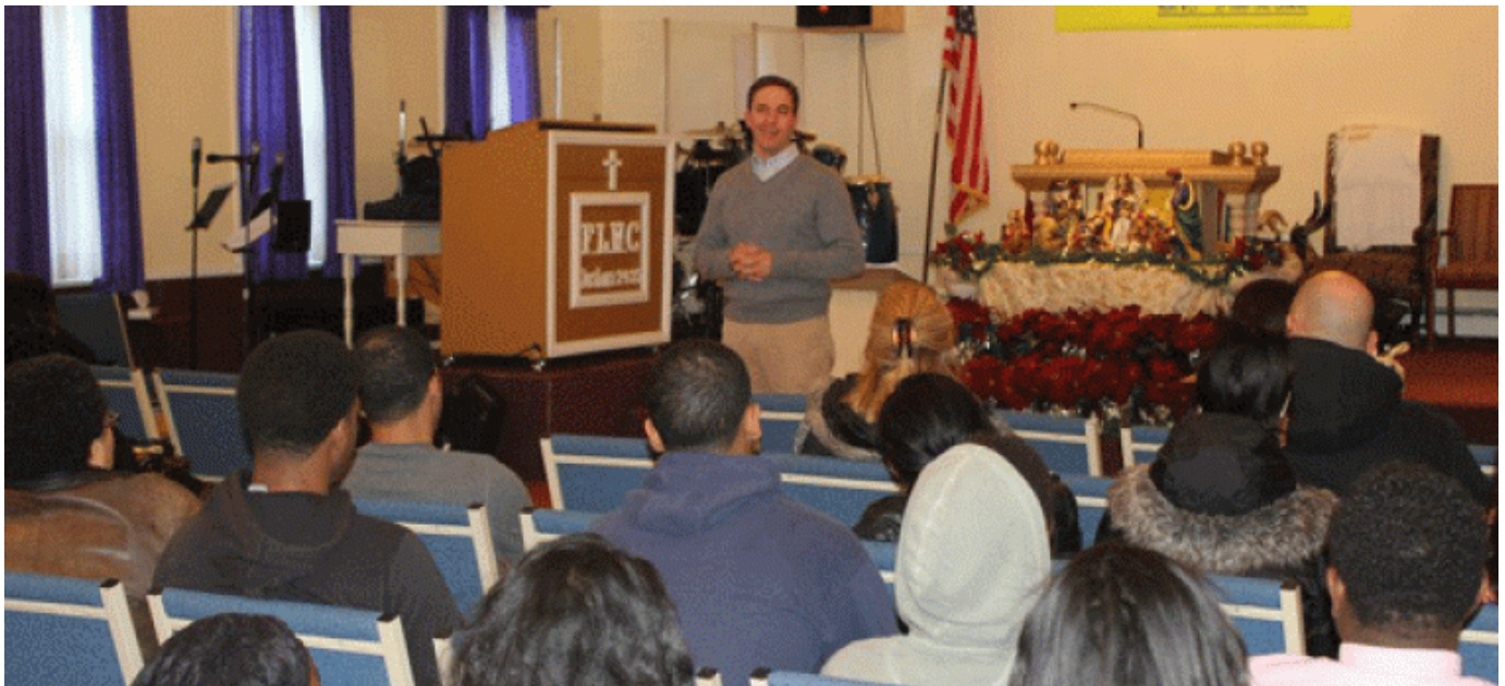
Senator Jack Martins addresses over 300 Martins Classic 3on3 volunteers at the Family Life Center in Elmont. The 10th Anniversary tournament is being played on July 13th!