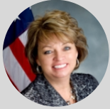
NEW YORK STATE SENATOR Patty Ritchie