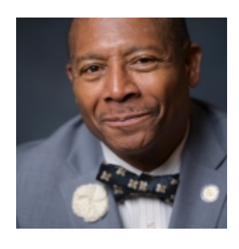
NEW YORK STATE SENATOR