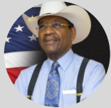
NEW YORK STATE SENATOR Ruben Diaz