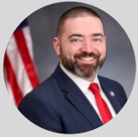
NEW YORK STATE SENATOR Fred Akshar