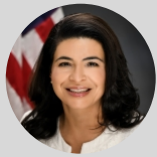
NEW YORK STATE SENATOR Anna M. Kaplan