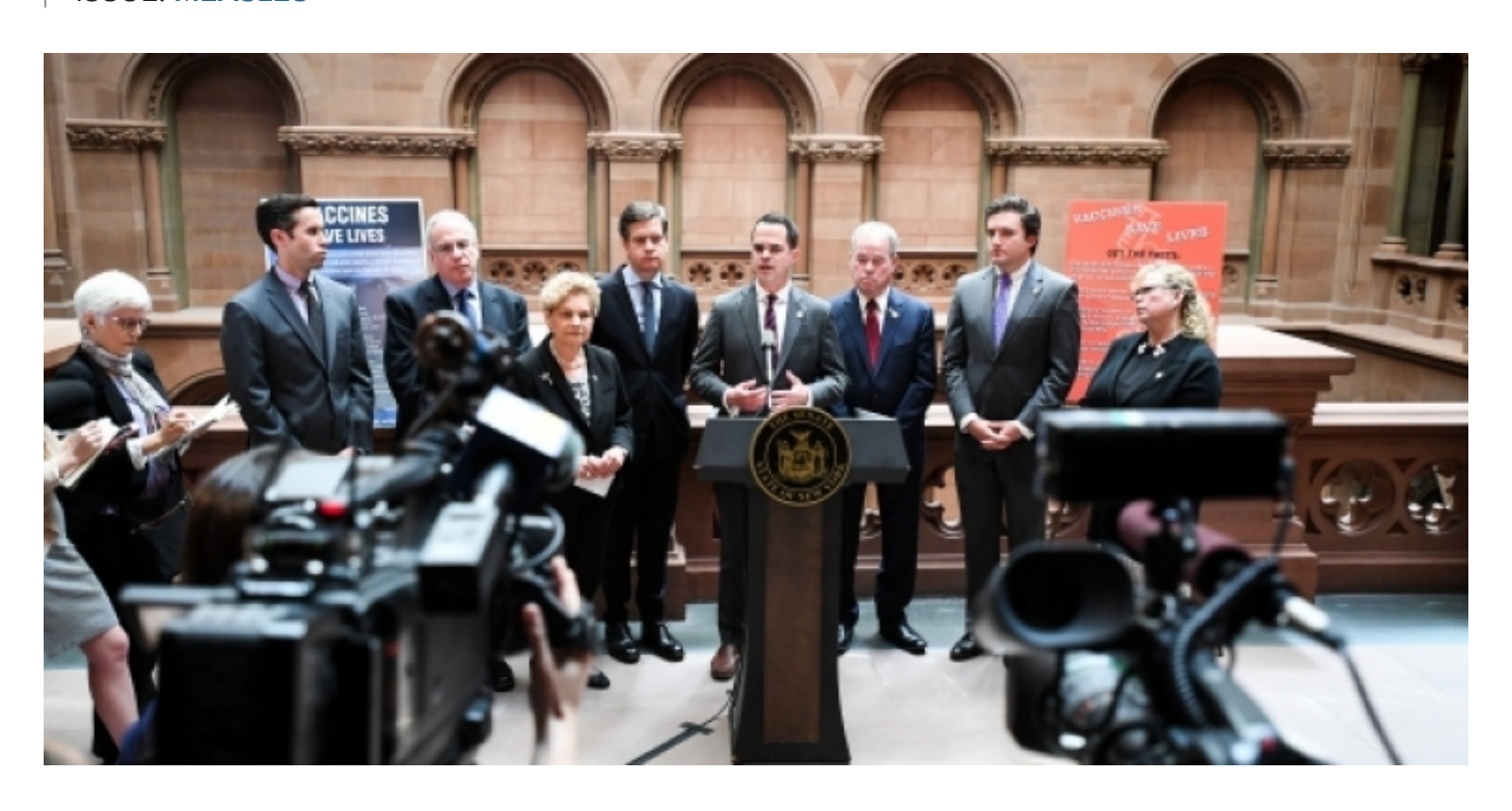
(Albany, NY) -- For World Immunization Week, Senator David Carlucci (D-

Rockland/Westchester) was joined in Albany by Rockland County Executive Ed Day, fellow state lawmakers and health advocates to address the life-saving importance of vaccines and to support legislation (S.2994, S.5136) to combat the spread of Measles in New York State.