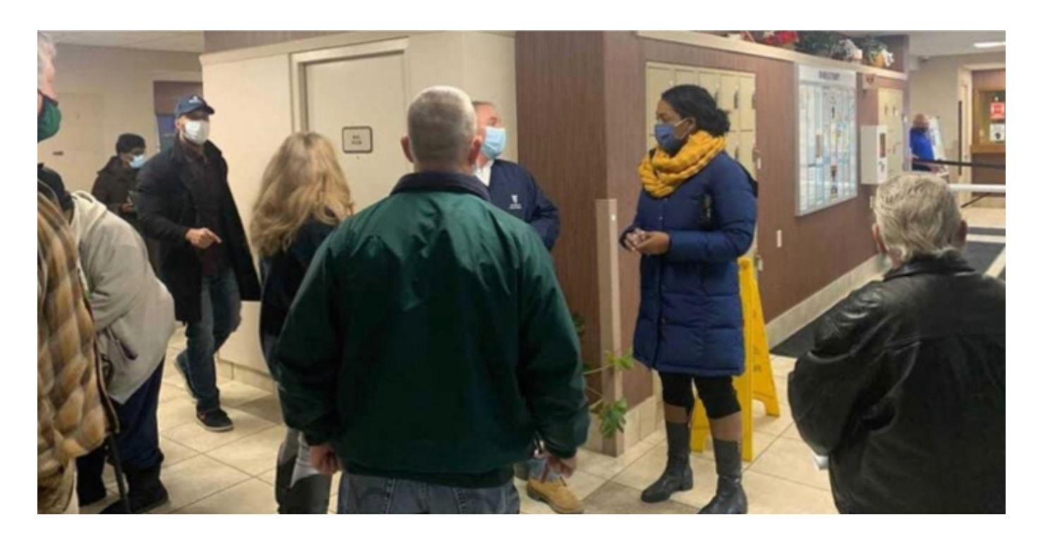
Rochester, NY - Senator Samra Brouk (SD-55), a member of the Senate Committee on Health, visited a COVID vaccination distribution site at Seneca Towers in Rochester, NY.