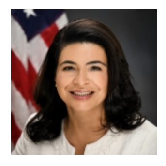
NEW YORK STATE SENATOR