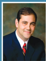
Senator Andrew Lanza