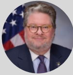
NEW YORK STATE SENATOR Pete Harckham