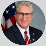
NEW YORK STATE SENATOR James Tedisco