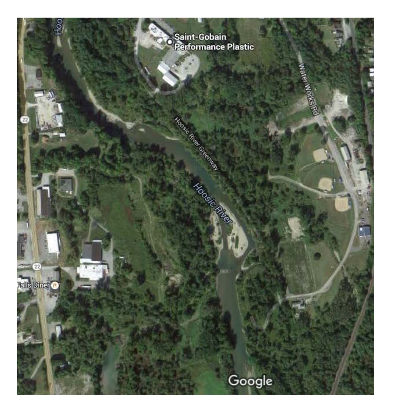
Figure 1. Geographic Relationship of Saint-Gobain Performance Plastics and the Water Treatment Plant on Water Works Road, Village of Hoosick Falls, New York