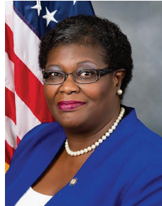
Senator Roxanne J. Persaud NYS SD 19