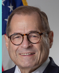
Congress Member Jerry Nadler