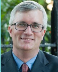
State Senator Brian Kavanaugh