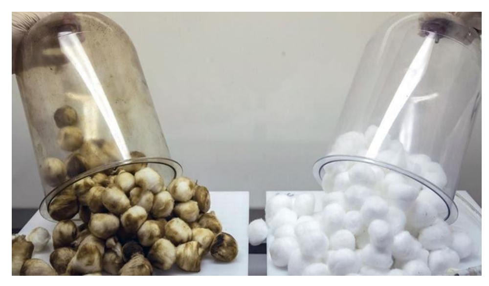
1-month experiment, smoking vs. vaping View 2018 PHE Lab Experiment: <a href="https://youtu.be/ZR_4PsYksfs">https://youtu.be/ZR_4PsYksfs</a>

"The false belief that vaping is as harmful as smoking could be preventing thousands of smokers from switching to ecigarettes to help them quit." — Dr. Lion Shahab, University College London