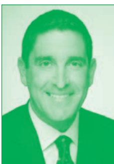
Sponsored by State Senator Jeff Klein