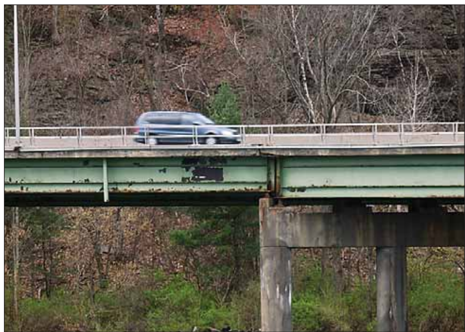
THE LEADER FILES

Plans had been in place to replace the 50-plus-year-old bridge in fiscal year 2013-14, but the money for the project was accelerated and included in the 2012-13 budget under the "New York Works" initiative. It was part of a $107 mil-