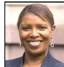
Council Member Letitia James