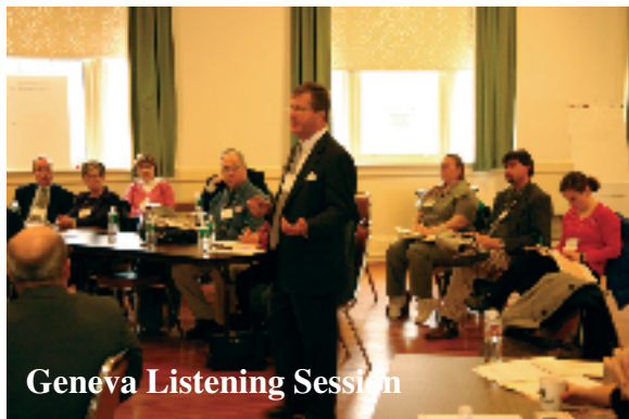
Geneva Listening Session