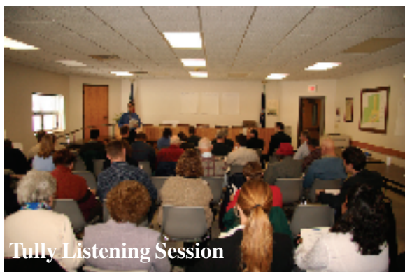
Tully Listening Session

T he Rural Vision Initiative also gratefully acknowledges the many individuals and state organizations who participated in both the listening sessions and the symposium: NYS Office of Mental Health, NYS Office of Children and Family Services, NYS Office of Temporary and Disability Assistance, NYS Department of Labor, NYS Department of Transportation, NYS Office of Real Property Services, NYS Canal Corporation, NYS Education Department, NYS Energy and Research Development Authority, NYS Department of Health, NYS Department of Environmental Conservation, NYS Department of Public Service, NYS Division of the Budget, Center for Health Workforce Studies/SUNY School of Public Health and NYS Tug Hill Commission. Many thanks to the people of New York State who participated in the Rural Vision Initiative over the past year.