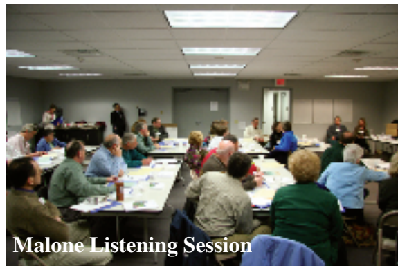
Malone Listening Session