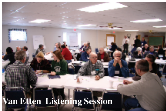
Van Etten Listening Session

T he Rural Vision Initiative also gratefully acknowledges the many individuals and state organizations who participated in both the listening sessions and the symposium: NYS Office of Mental Health, NYS Office of Children and Family Services, NYS Office of Temporary and Disability Assistance, NYS Department of Labor, NYS Department of Transportation, NYS Office of Real Property Services, NYS Canal Corporation, NYS Education Department, NYS Energy and Research Development Authority, NYS Department of Health, NYS Department of Environmental Conservation, NYS Department of Public Service, NYS Division of the Budget, Center for Health Workforce Studies/SUNY School of Public Health and NYS Tug Hill Commission. Many thanks to the people of New York State who participated in the Rural Vision Initiative over the past year.