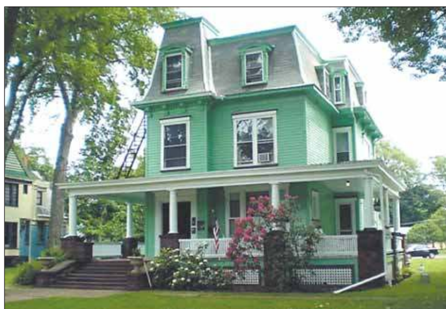
PROVIDED TO THE LEADER