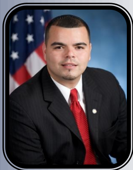
Hon. Marcos Crespo New York State Assemblyman