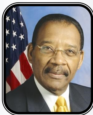
Hon. Rubén Díaz New York State Senator