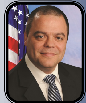
Hon. Luis Sepulveda Asambleista Estatal