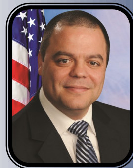
Hon. Luis Sepulveda New York State Assemblyman