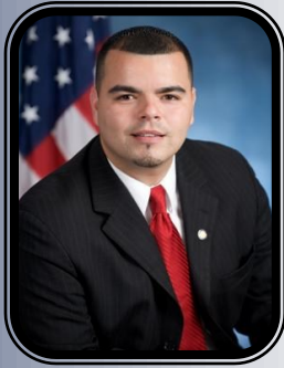
Hon. Marcos Crespo Asambleista Estatal