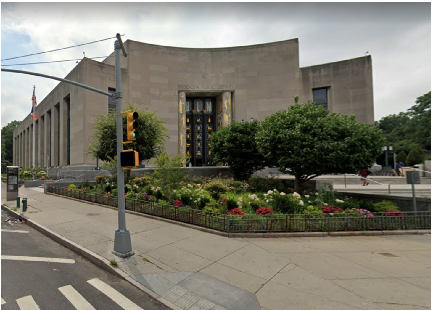
Brooklyn Public Library