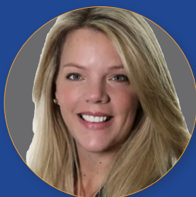
Senator ALEXIS WEIK