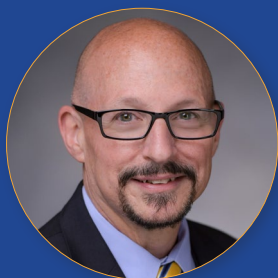
Senator DEAN MURRAY

THIS EVENT IS BROUGHT TO YOU BY THE GOVERNOR IN CONJUNCTION WITH: