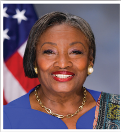
Senator Andrea Stewart-Cousins