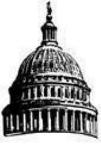
Nydia Velazquez Congresswoman