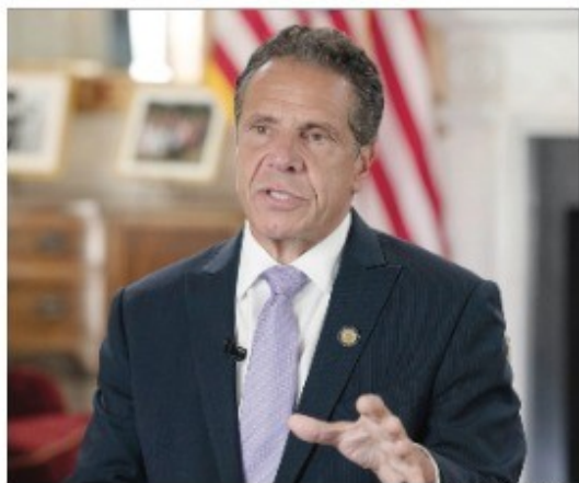
Gov. Andrew Cuomo gives a virtual COVID-19 briefing July 28 in the state Capitol in Albany.