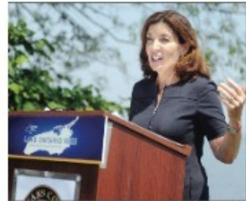
Gov. Kathy Hochul speaks last month near the Ontario Lake shore.

"I think given the circumstances the best way I can help now is to focus on the government get back to governing." Gov. Kathy Hochul, a Democrat, will take Cuomo's place, and become the state's first female governor through Cuomo's third term, which expires Dec. 31, 2022.