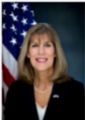
NYS SENATOR DAPHNE JORDAN (R, C, IP, REF) 43RD SENATE DISTRICT