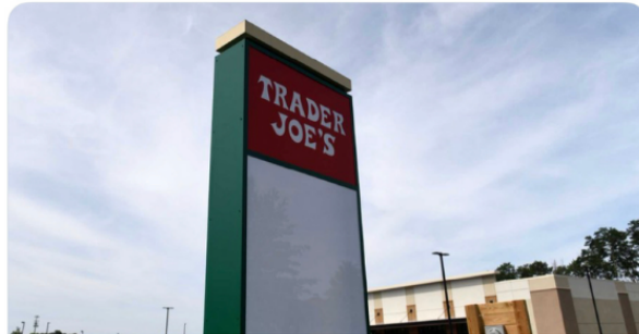
timesunion.com Trader Joe's opening in Halfmoon Sept. 8

Great news for my hometown of #Halfmoon , #SaratogaCounty and all of the surrounding communities in the #CapitalRegion . Trader Joe's opening in Halfmoon Sept. 8 and I can't wait! timesunion.com/news/article/T... via @TimesUnion