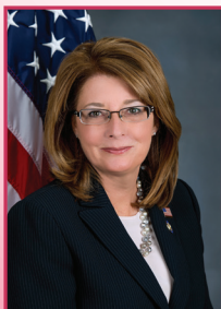
NYS SENATOR PAMELA A. HELMING