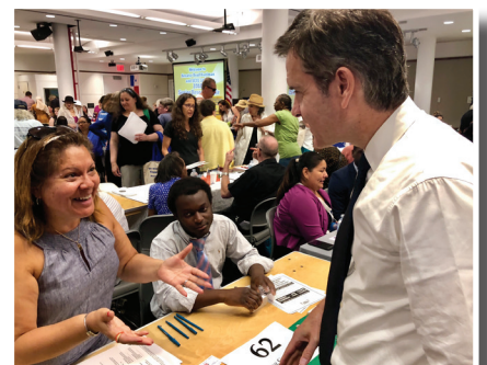
My Senior Resource Fair with SEIU 32BJ this year was bigger than ever with nearly 60 vendors and over 500 people attending!