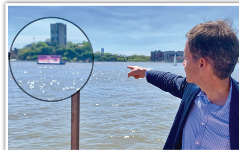
My legislation with Assemblymember Dick Gottfried bans electronic floating billboards like this.

The number of collective accomplishments are too many to mention here. (For a complete summary of my work this session, please contact me or visit my website.) Specific to my work, the Senate passed 53 bills of which I was the lead sponsor, including many of my top legislative priorities that I discuss in this update.