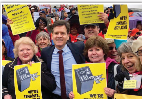
I rallied with Stuy Town tenant leaders at the State Capitol for stronger rent laws.

On June 14, the Legislature passed sweeping reforms to New York's rent laws. For the first time, the rent laws have been permanently extended, putting an end to the dysfunction and legislative hostage-taking that occurs every time the rent regulations face expiration. The measures include completely eliminating vacancy deregulation, high-income deregulation and vacancy bonuses. Also, reforms to the MCI and IAI systems will reduce extreme rent hikes and end abuses. In addition, we passed new legal protections for all tenants that include protections against retaliatory evictions, limiting security deposits to one month's rent, banning tenant blacklists, imposing criminal and civil penalties for unlawful evictions, and much more.