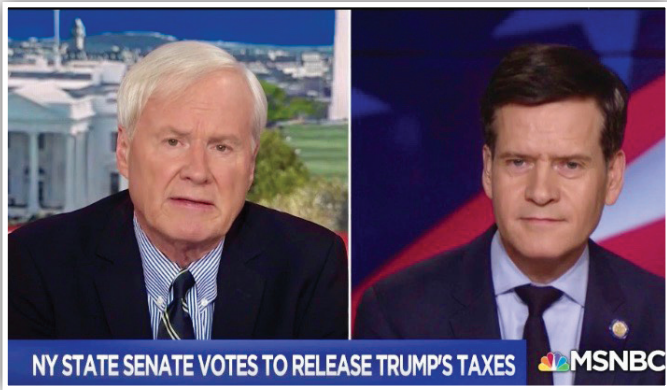
My new legislation could help Congress finally obtain Trump's taxes.

Somewhere in Albany, decades of Donald Trump's tax returns are languishing in a filing cabinet. To assist Congress with its constitutional oversight responsibilities that are being blocked by the White House, the Legislature passed my legislation, the TRUST Act (S.5072-A / A.7194-A), authorizing New York to share the state tax returns of public officials with Congressional tax committees upon written request. The President's stonewalling and mockery of the rule of law are precipitating a constitutional showdown, and I'm glad that my colleagues and I took steps this session to help avert this dire situation. The legislation was signed into law by Governor Cuomo on July 8.