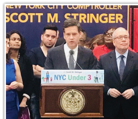
NYC Comptroller Scott Stringer and I announced legislation to dramatically expand affordable childcare.

As successful as this session was, I'm continuing to work on some unmet priorities. These include bills to legalize gestational surrogacy agreements so LGBTQ and New Yorkers struggling with infertility can create families, ban the growing scourge of unwanted robocalls, protect immigrants by prohibiting ICE from arresting people outside of courthouses, make wealthy foreigners pay their fair share through a "pied-a-terre" tax on luxury second and third homes, and expand routine HIV testing -- to name just a few. I'd really love to know your ideas for new legislation, as well.