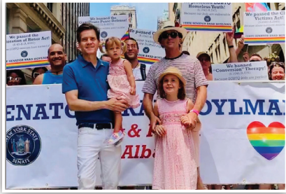
With my family at the World Pride March celebrating this year's victories.