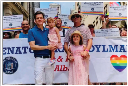
With my family at the World Pride March celebrating this year's victories.