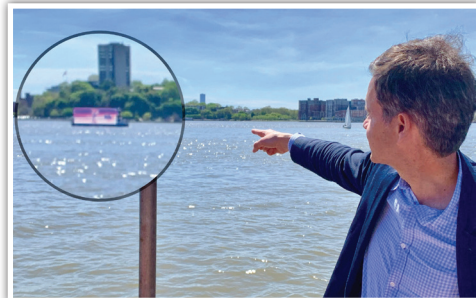
My legislation with Assemblymember Dick Gottfried bans electronic floating billboards like this.

The number of collective accomplishments are too many to mention here. (For a complete summary of my work this session, please contact me or visit my website.) Specific to my work, the Senate passed 53 bills of which I was the lead sponsor, including many of my top legislative priorities that I discuss in this update.