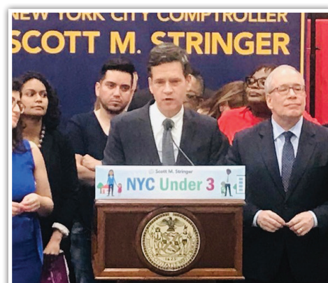
NYC Comptroller Scott Stringer and I announced legislation to dramatically expand affordable childcare.

As successful as this session was, I'm continuing to work on some unmet priorities. These include bills to legalize gestational surrogacy agreements so LGBTQ and New Yorkers struggling with infertility can create families, ban the growing scourge of unwanted robocalls, protect immigrants by prohibiting ICE from arresting people outside of courthouses, make wealthy foreigners pay their fair share through a "pied-a-terre" tax on luxury second and third homes, and expand routine HIV testing -- to name just a few. I'd really love to know your ideas for new legislation, as well.