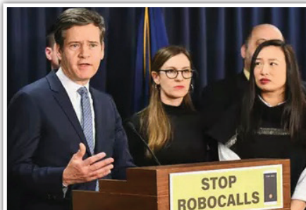
I introduced the Robocall Prevention Act with Assemblymember Yuh-Line Niou, the strongest legislation of its kind in the nation.