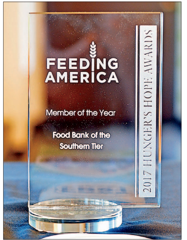
The Food Bank of the Southern Tier won Member of the Year from Feeding America, the highest recognition a food bank can achieve.