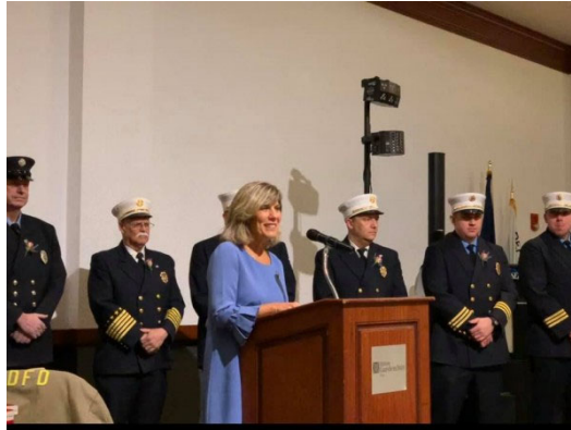
The Defreestville and Wynantskill Fire Department's 2020 Inspection Banquet