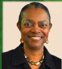
Senator Velmanette Montgomery