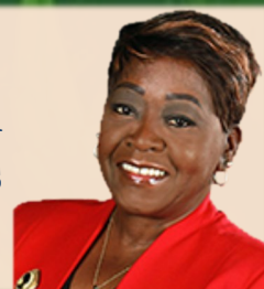
Assemblywoman Crystal Peoples-Stokes