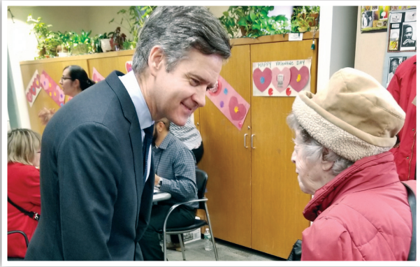
Meeting neighbors at my senior citizen "Rent Freeze" workshop at Stuy Town.