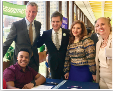
At the launch of a citywide student voter drive with the Mayor and Borough President.

In May, the Senate Democratic Policy Group, which I chair, released “Why Don’t More New Yorkers Vote? A Statewide Snapshot Identifying Low Voter Turnout.” Our state ranks 41st in the nation in turnout, which can be attributed to antiquated and confusing voting laws. In response, the Senate Democratic Conference released a reform package that includes, among other things, legislation to enact early voting, permit no-excuse absentee voting, create automatic voter registration, allow preregistration for 16- and 17-year olds, shorten the deadline for party enrollment, and consolidate the federal and state primaries. For a copy of the report, visit my website or call me at 212-633-8052.