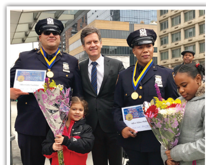
Presenting a Senate Liberty Award to officers who delivered a baby on 10th Avenue.

I'm looking forward to next year's session, after the midterm elections, which promises new opportunities to pass progressive legislation. I wouldn't be in politics if I wasn't an optimist!