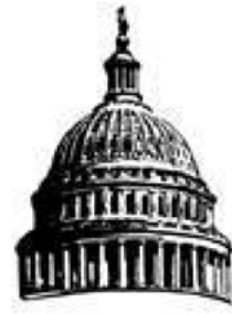
Nydia M. Velázquez Congresswoman